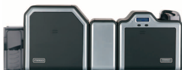
Lamination option and dual-sided printer/encoder