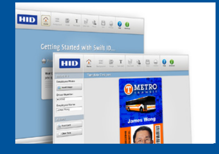
No software required: Swift ID™ embedded badging software eliminates the need to install PC software, so the printer is ready to use out of the box.

The FARGO® DTC1000 Direct-to-Card printer is simplicity at its finest. Its sleek user-friendly design is geared towards anyone looking for a highquality card personalization printer to make great-looking, full-color plastic ID and technology cards on a budget. From producing company and school IDs and access cards, to membership and customer loyalty cards, the DTC1000 delivers a convenient printing and encoding solution.