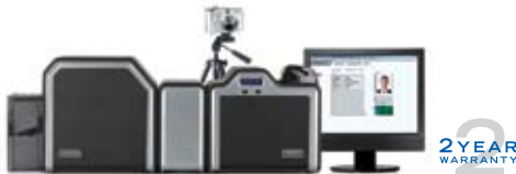
HDP5000 printer/encoder shown with optional two-sided printing and lamination modules.