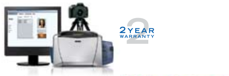
DTC400 printer/encoder shown with Fargo Asure ID software.