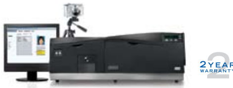
DTC550 printer/encoder shown with optional lamination module.